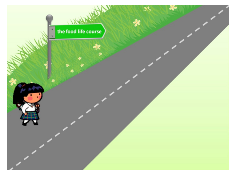
Figure 1: The Food Life Course. Female students' eating behaviours may meander during the transition to university

If I asked you to draw your food habits over your lifetime as a pathway what would it look like? Would it be a straight line, or perhaps have more of a meandering appearance? This research looks at food habits like a pathway through life, or the Food Life Course, concentrating on how food habits are formed and how subsequently these habits are refashioned due to a change in circumstances. We develop patterns of behaviour around food in childhood largely as a result of familial influences and these behaviours evolve as an individual moves through different life stages. However, the impact of life events on an individual's food choices can vary depending on social and personal influences and the eating environment itself.