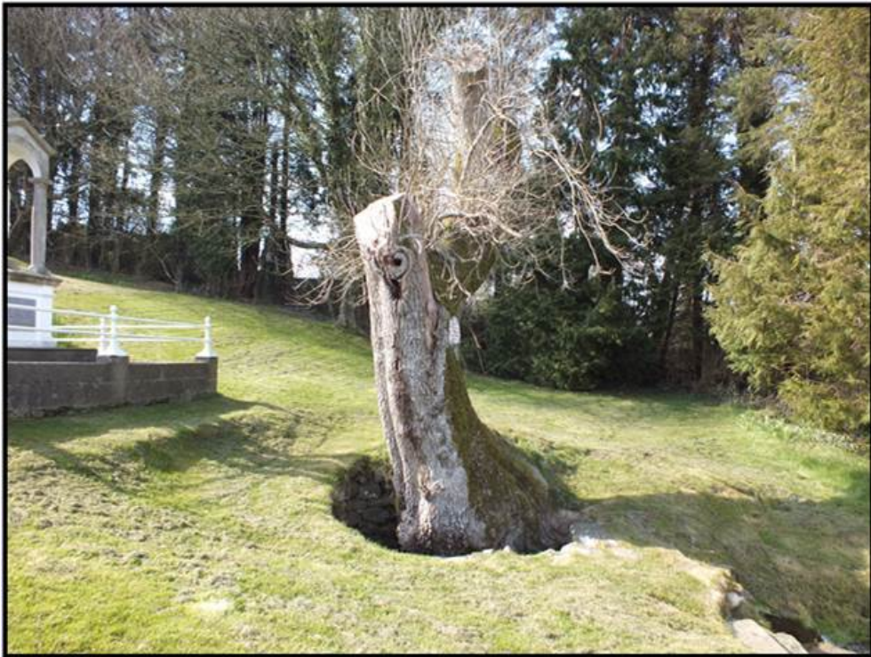
Figure 1: St. Cuan Well, Tobarchuain, Co. Waterford. An ash tree growing from base of the well.

underwood cannot be fully discerned using the literary sources, which makes wood selection and procurement difficult to interpret. Woodland reconstruction using the medieval Irish records is also highly problematic as these are often chronologically and geographically fragmented.